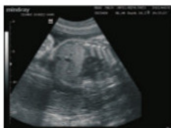
Fetus abdomen and ribs