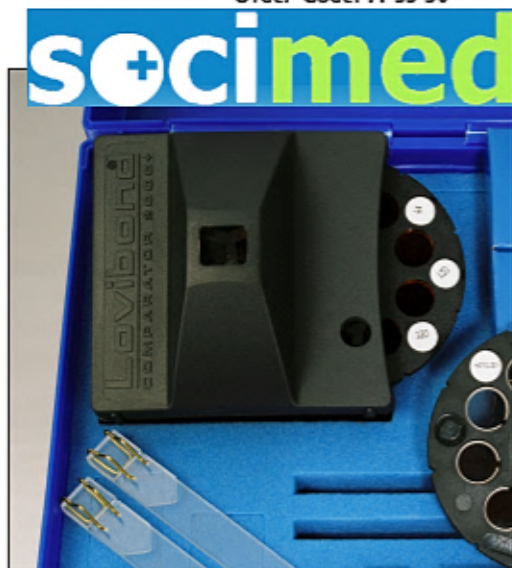
AF353 Test Kit