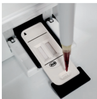
Drop the specimen on cartridge