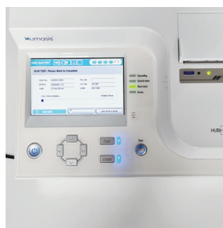
Analyzing the cartridge