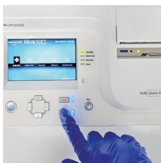
Start run test