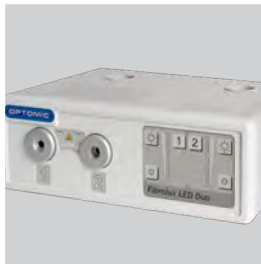
FIBROLUX DUO LIGHT SOURCE