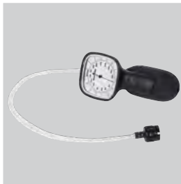
LEAKAGE TEST DEVICE