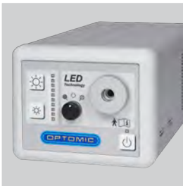
FIBROLUX LED LIGHT SOURCE